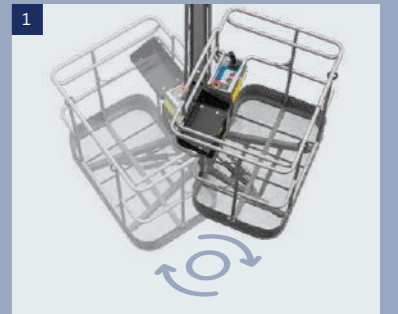
Basket: can be rotated left and right at an Angle of 140°