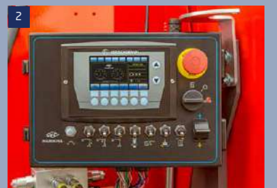
Base control box: the control box can be used to control each action of the device, easy to understand