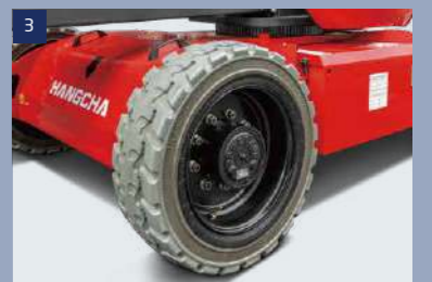
Tires: foam-filled tires with good off-road performance