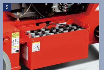
Standard tracking battery: Reduce 40% of the charge time, raise 50% of the life time