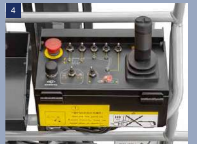
Basket control box: each action of the device can be controlled through the control box to quickly reach the working area, and the control is simple and easy to understand